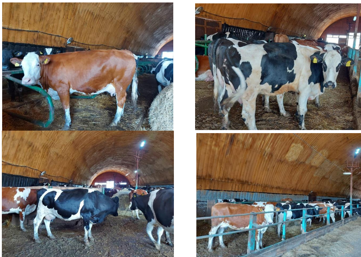
Figure 1 – Housing conditions in Kamyshenka Dairy Farm

In 2022 and 2023, field studies were organized on two industrialized dairy farms in central (Kamyshenka LLP) and northern (Ayna Dairy Farm LLP) Kazakhstan, when cows were indoors. Here the welfare of 110 cows was measured according to 33 parameters, 12 criteria and 4 principles. Figure 1 shows the moments of animal-oriented measurements in conditions of the Kamyshenka Dairy Farm.