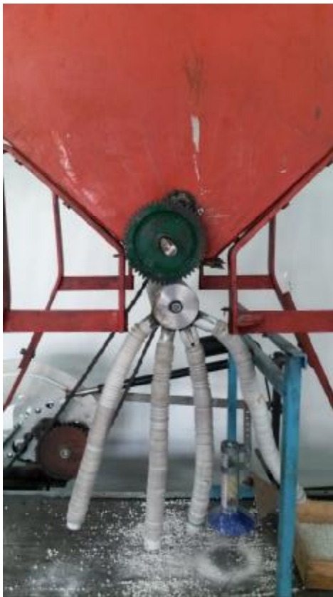
Figure 5 – Laboratory installation

grain tank with the seed distributor, the running tape are installed, figure 5. Fertilizer distributors receive the drive, which allows to change continuously the frequency of rotation and has the device for measurement of their value. For the endless streaming tape a separate drive is mounted.