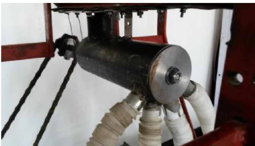
Figure 4 – The seed distributor fixed under the bunker