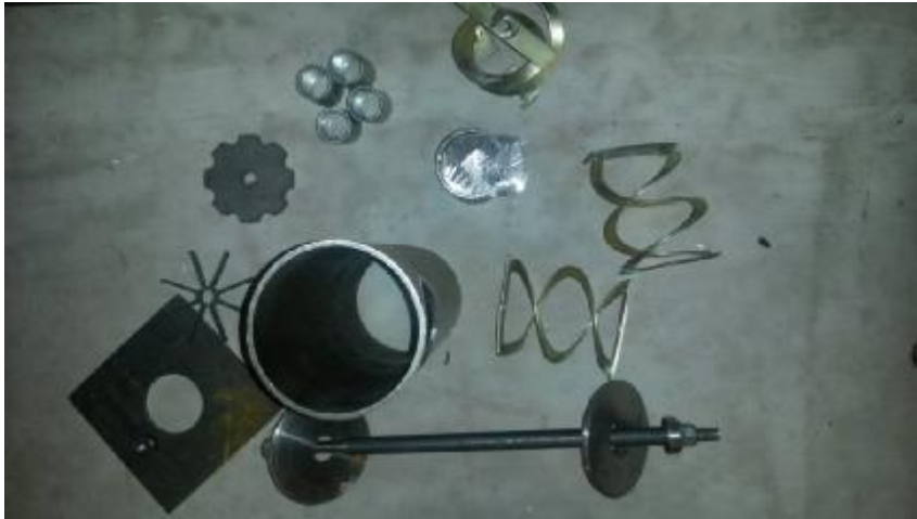
Figure 2 – Fertilizer distributor in unassembled form