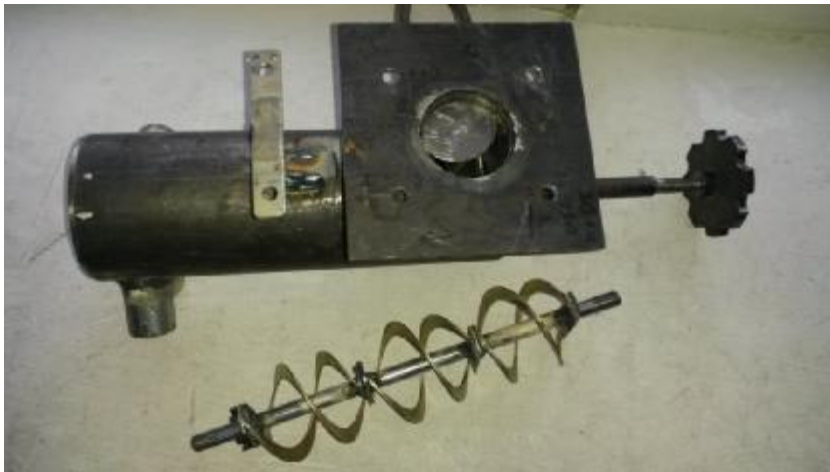
Figure 3 – Fertilizer distributor in assembled form